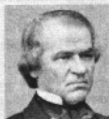
ANDREW JOHNSON (1865-69)

Adams is blamed for a 1798 diplomatic episode that led to a two-year undeclared war with France and deep divisions between the Federalists and Democratic-Republicans.