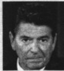
RONALD REAGAN (1981-89)

Harding's administration is tainted when his Secretary of the Interior is convicted and jailed for selling the rights to oil reserves in Teapot Dome, Wyoming, for personal profit.