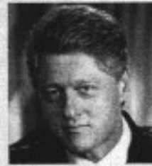
BILL CLINTON (1993-2001)

Reagan's administration secretly sells weapons to Iran in exchange for American hostages, then uses the money to fund the anti-Communist 'contras' in the Central American nation of Nicaragua.