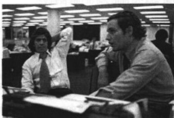
Washington Post reporters Carl Bernstein (left) and Bob Woodward won a Pulitzer Prize in 1973 for their coverage of Watergate.

The most sensational revelation came in July 1973, when a former White House aide revealed that Nixon had a secret taping system in the Oval Office and had been recording his conversations and