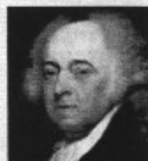
JOHN ADAMS (1797-1801)

Other presidents who've found themselves in hot water