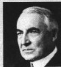
WARREN HARDING (1921-23)

A hostile Congress impeaches President Lincoln's successor for violating a law that's later ruled unconstitutional. The Senate vote is 35 to 19, one short of the two thirds needed to remove Johnson from office.